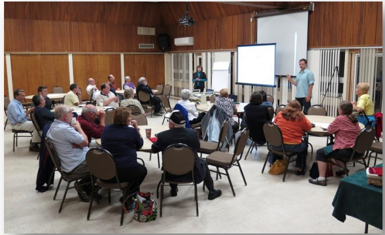
2 - Summer Monthly Meetings Refining the Vision

Following the initial Visioning, the Green Team dedicated their next three monthly meetings to continuing the conversations started at the Visioning with the goal of fine tuning the action ideas developed at the visioning and ranking the actions with members of the community. Ranking of the actions was based on the achievability of the action, the impact of the action, the capacity of the Green Team and the community to complete the action and the potential cost of the action. After the ranking of all