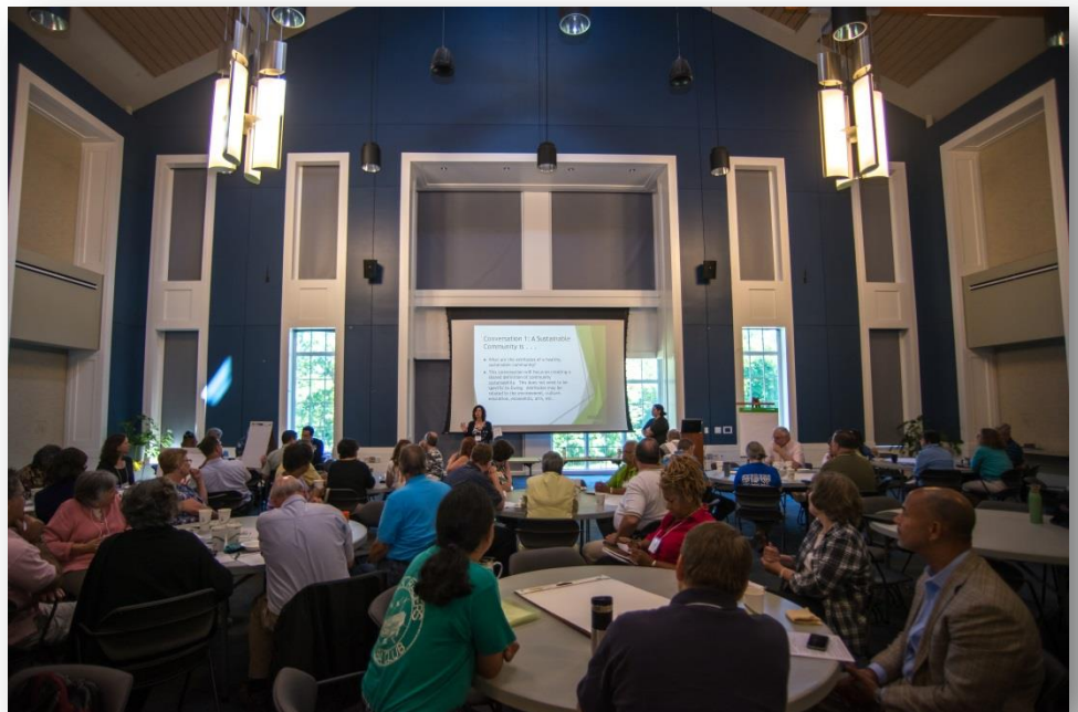
1 - June 7 Community Conversation at TCNJ

Participants then spent the rest of the visioning having conversations in groups of 5 to 7 people, recording their conversations on paper and reporting on their conversations to the rest of the group at allotted times. Based on these conversations, key