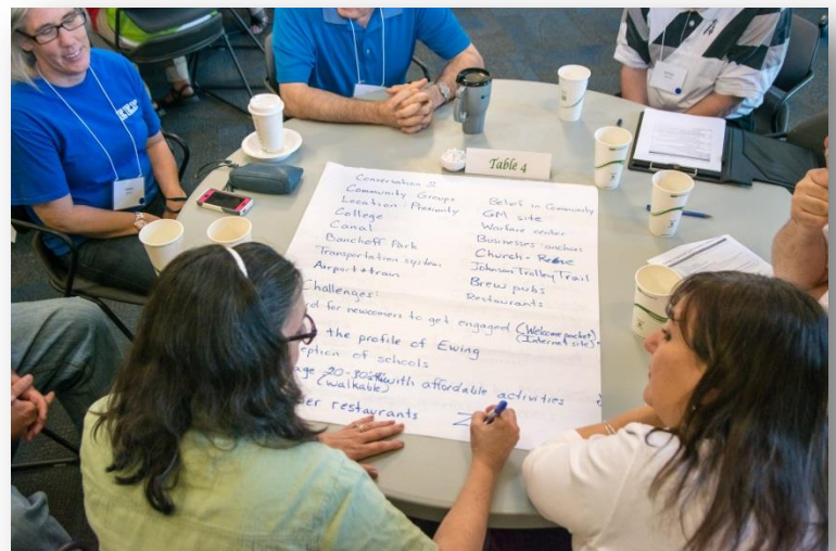
4 - Visioning 1 Conversation